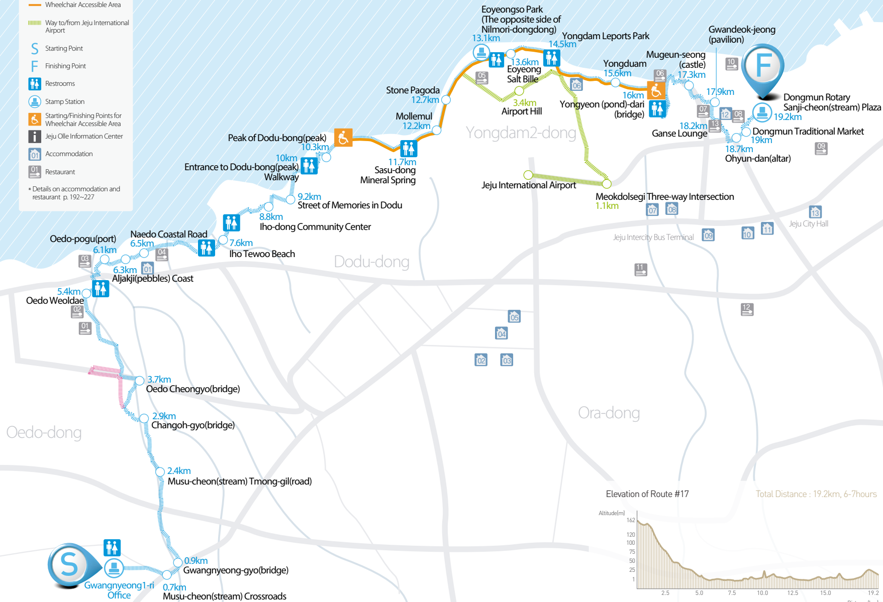
Elevation of Route #17 Total Distance : 19.2km, 6-7hours

* Details on accommodation and restaurant p. 192-227